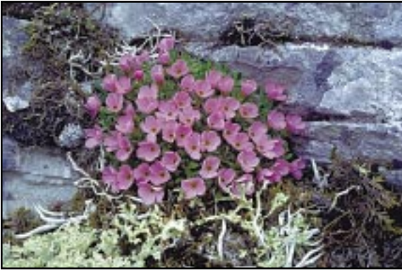
Closeup of Douglasia beringensis