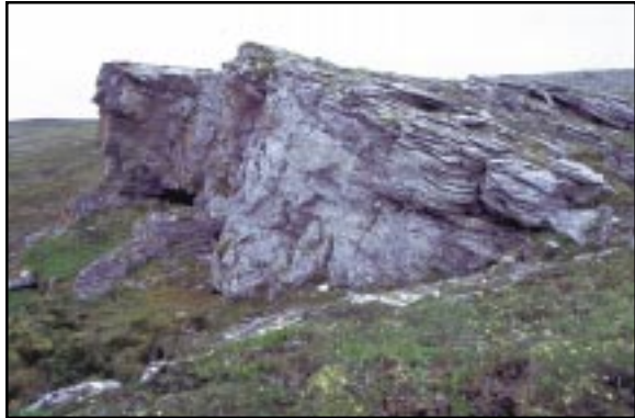
Douglasia beringensis habitat