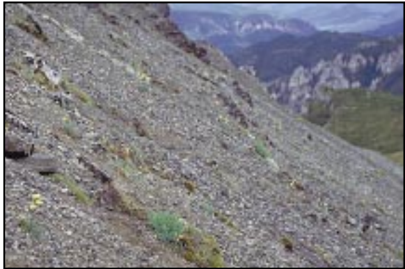
Erysimum asperum habitat