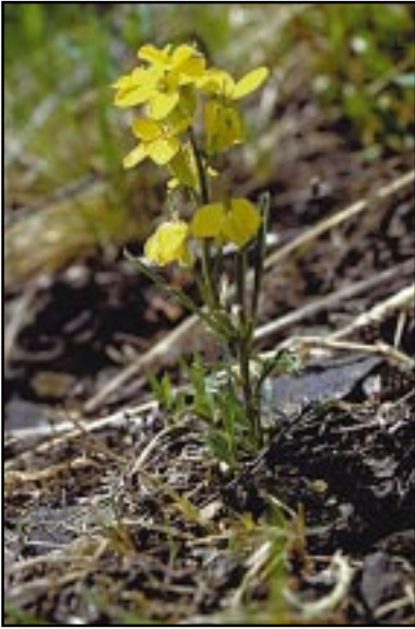
Erysimum asperum