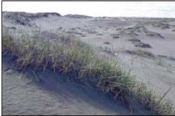
Poa hartzii habitat