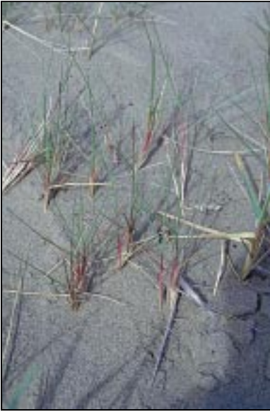
Closeup of Poa hartzii