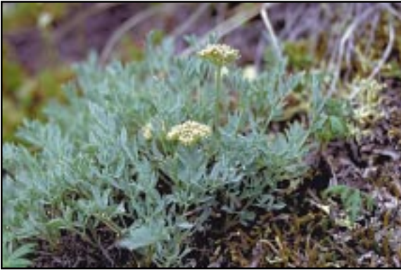
Closeup of Podistera yukonensis