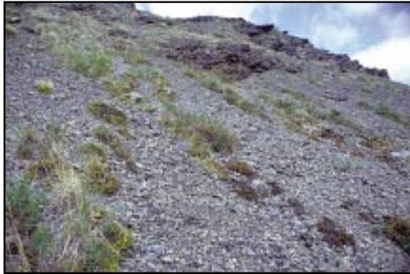
Podistera yukonensis habitat