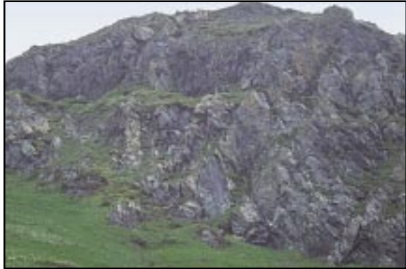
Polystichum aleuticum habitat