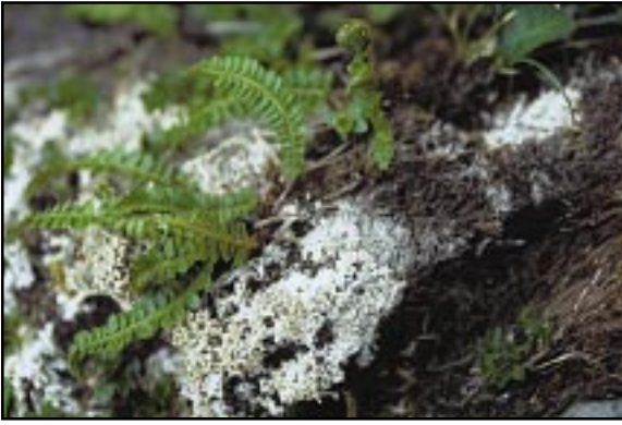
Closeup of Polystichum aleuticum