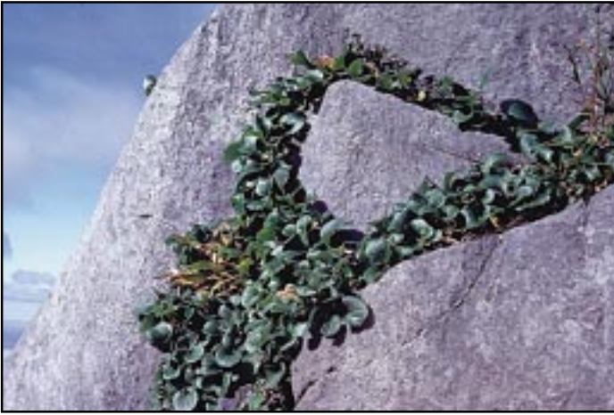
Closeup of Salix reticulata