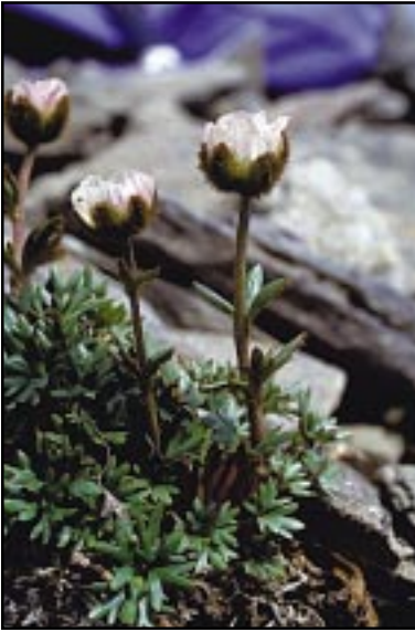
Closeup of Beckwithia glacialis