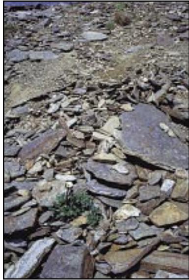
Beckwithia glacialis habitat